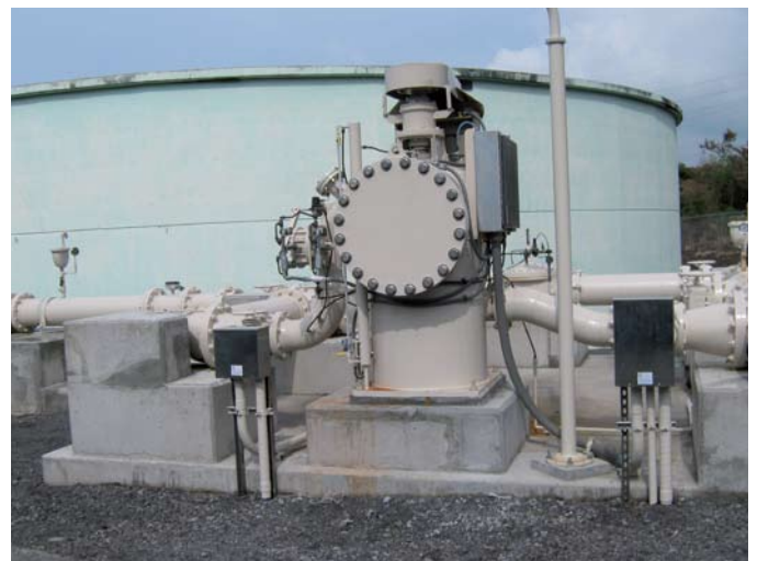
A 35kW Pelton-type SOAR GPRV installed for the County of Hawaii Department of Water Supply

Variable flow, for example, would suggest the use of impulse turbines such as Pelton or turgo. With a broad efficiency curve, impulse turbines can often deliver good performance down to 10% of design flow. But a pressurised output complicates matters. Impulse turbines, by definition, run in open air and typically employ a tailrace that is not easily pressurised.